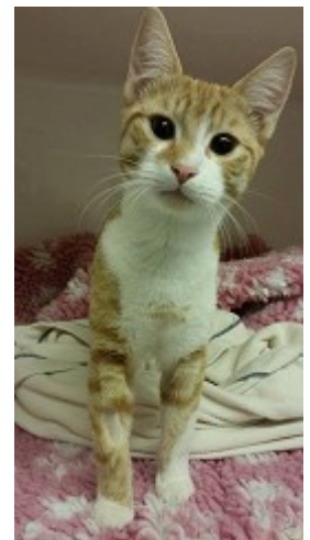
Timothy the kitten after after his neutering (and cuddles)